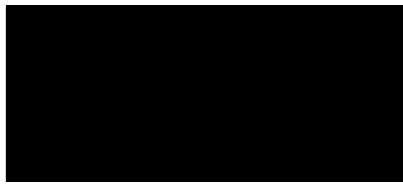
Tim Marks Head of Planning

Enc: Table 1.1: Applicant's supporting documents (Volume 20) Table 1.2: Applicant's supporting documents (Volume 19), originally submitted 30 November 2023